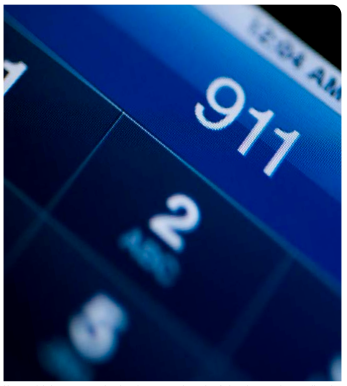
If you think you may be having a stroke, don't hesitate... immediately call 9-1-1 or your emergency response number.

Before you need to take emergency action, find out where the emergency entrance is to your nearest hospital. Also, keep a list of emergency phone numbers next to your phone and with you at all times, just in case. Take these steps NOW!